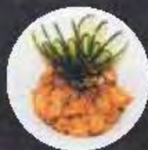
PANKO TUNA SALAD Fresh Tuna - Spicy Mayo - Tempura Crunchy 27,000