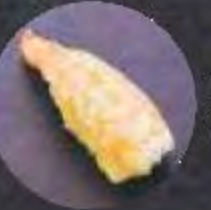
EBI Shrimp 11,300