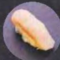
HAMACHI Yellow Tail 12,000