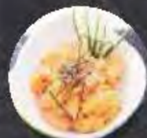
PANKO SALMON SALAD Fresh Salmon - Cucumber - Spicy Sauce - Mayo - Tagarashi 28,200