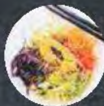
SESAME SEED SALAD Cabbage- Cucumber- Carrots- Sesame Seeds 12,000