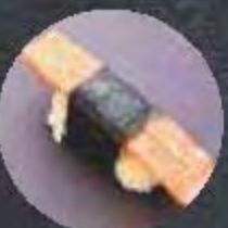
KANI Crabsticks 9,500