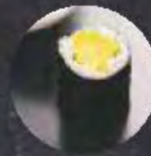
AVOCADO MAKI 5,400