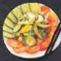
GREEN VALLEY SALAD Avocado-Cabbage- Carrot-Mixed Lettuce 13,600