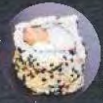
KUWARI MAKI Salmon - Crabstick - Cream Cheese - Sesame Seed 13,800