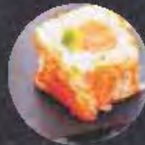
NAKED Salmon - Avocado - Tobiko 11,700