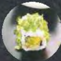
SPRING VEGGIE ROLL Asparagus - Spring Onion - Avocado - Oshinko - Cucumber 11,000