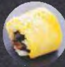
MANGO SPECIAL ROLL EEL Eel - Mango - Mango Sauce - Cucum Ber 20,200