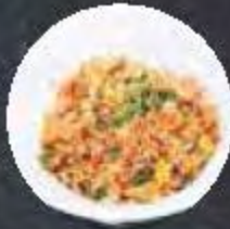
CHICKEN FRIED RICE Chicken Breast - Carrots - Zucchini 9,900