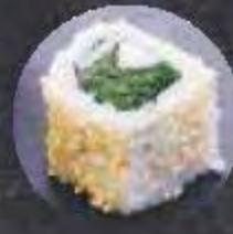
IWA ROLL Avocado - Cucumber - Boiled Spinach 10,500