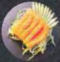
SHAKE Salmon 19,700