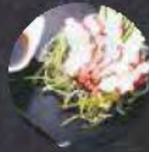
TAKO SASHIMI Octopus 7,300