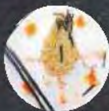
HEADOVER HILLS Shredded - Crab - Cucumber - Cabbage Carrots 25,200