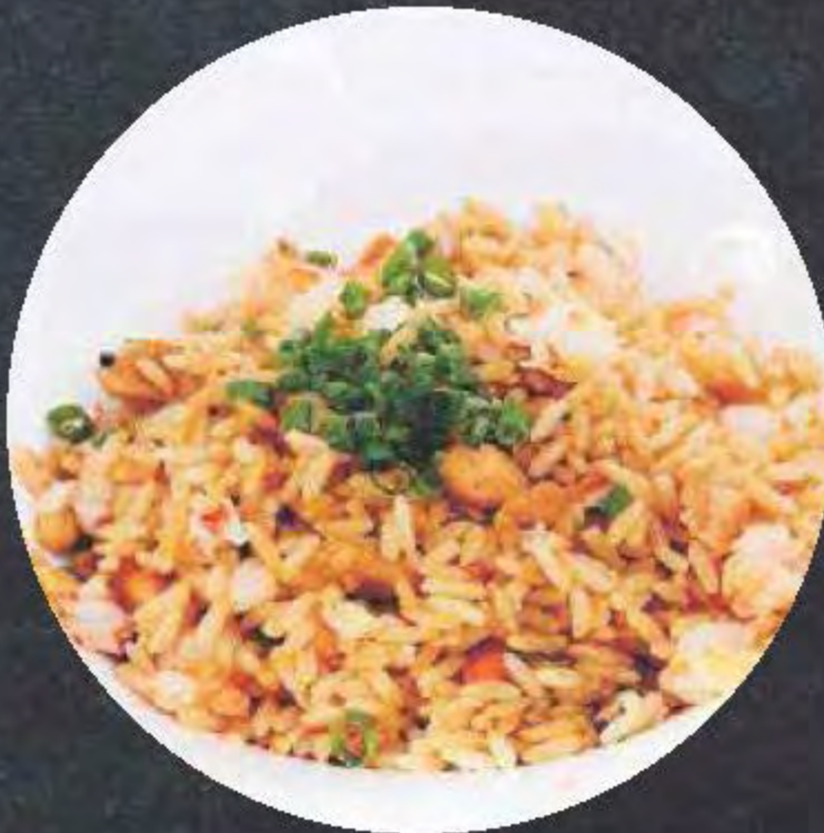
IZAN AGI FRIED RICE Chicken - Shrimps - Assorted Vegetables 13,800