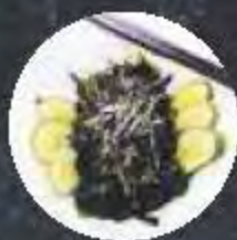
SEA WEED SALAD Wakami (Seaweed) - Cucumber - Sesame Seeds 16,200