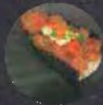
TUNA GUNKAN Tuna, Wasabi Sauce, Izuzukuri Sauce, Tobiko 12,400