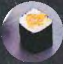
SPICY SALMON MAKI Salmon - Mayo - Togarashi 12,000