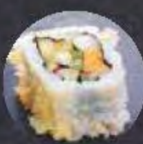
YAKI YASAI ROLL Red & Green Pepper - Asparagus - Black Mushroom 11,000