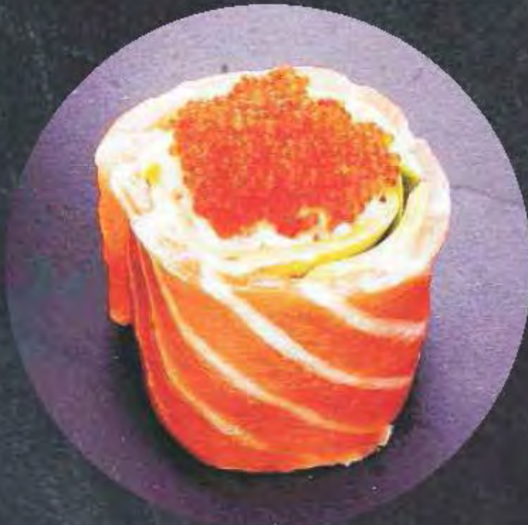
MELL MAKI Salmon - Crab - Avocado - Tobiko - Mayo 19,600