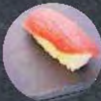
MAGURO Tuna 11,600