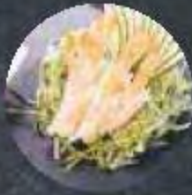
EBI Shrimp 13,200