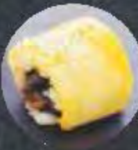
MANGO SPECIAL ROLL SALMON Spicy Salmon - Mango Sauce - Tempura Crispy 16,100