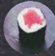
MAGURO MAKI Tuna 11,000