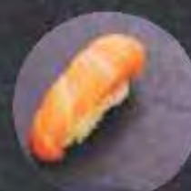
SHAKE Salmon 12,300