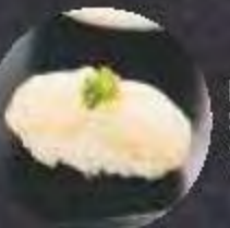
HOTATE GAI Scallop 12,400