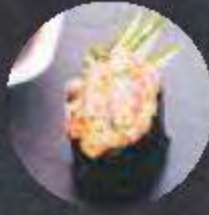
TATAKI TUNA Seared Tuna - Mayo - Tobiko Spring Onions - Rayu -Chili Powder 9,900