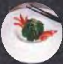
MARINATED SEA WEED Fresh Seaweed- Sesame Seed 25,200