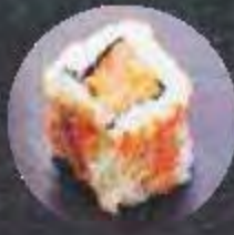
WHISTLE SPICY TUNA Tuna - Togarashi - Mayo - Rayu Wasabi 13,800