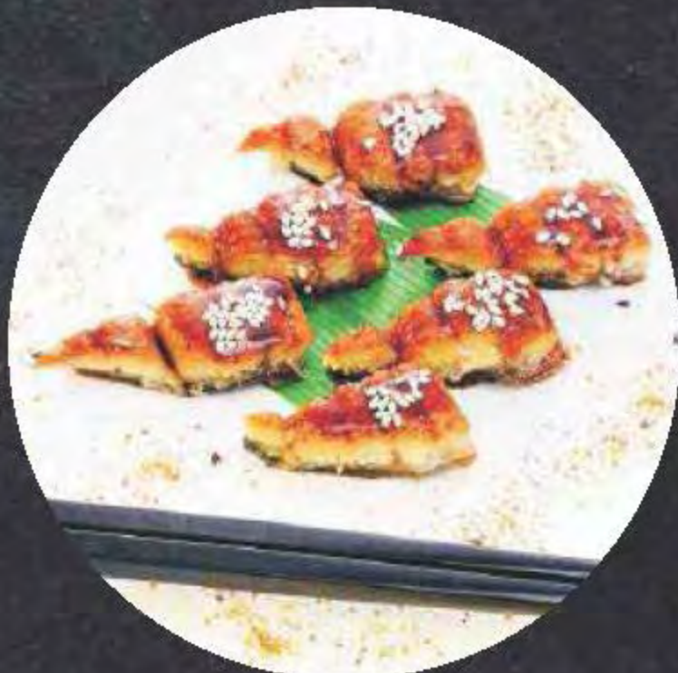
UNAGI Baked Eel 19,000