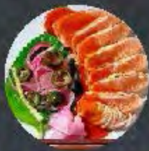
TATAKI SALMON 20,400