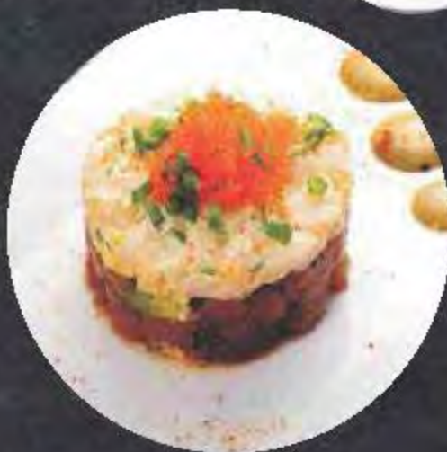
TUNA TARTAR Diced Tuna - Avocado - Scallop - Tabiko - Wasabi Sauce - Marinated with Ponzu Sauce 27,900