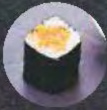
SALMON SKIN MAKI Crispy Grilled Salmon 7,800