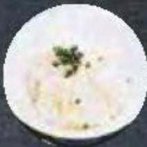
STEAMED RICE 5,400