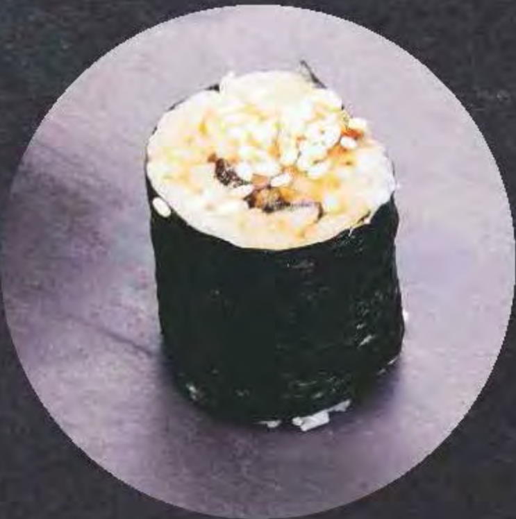
UNAGI MAKI Eel - Cucumber 13,100