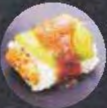
HIGH VOLTAGE ROLL - SALMON Avocado - Salmon 15,200