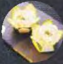
HOTATE GAI Scallop 19,800