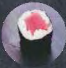
SPICY TUNA MAKI Tuna - Mayo - Togarashi 11,600