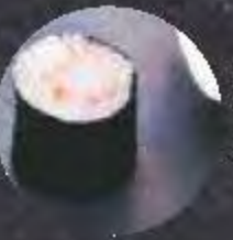
KANI MAKI Crabstick - Cucumber 10,000