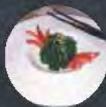
TATAKI MAGURO 19,200