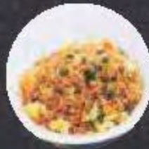
EGG FRIED RICE Egg - Carrots - Zucchini 8,800