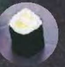
KAPPA MAKI Cucumber - Sesame Seeds 6,000