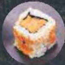
WHISTLE SPICY SALMON Salmon - Togarashi - Mayo - Rayu Wasabi 16,500