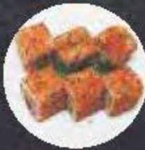
SPICY KANI ROLL Crabstick - Mayo - Tegarashi - Tobiko 11,300