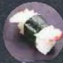
TAKO Octopus 8,900