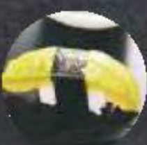
AVOCADO Avocado 8,100