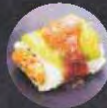
HIGH VOLTAGE ROLL - TUNA Avocado - Tuna - Spicy 14,300