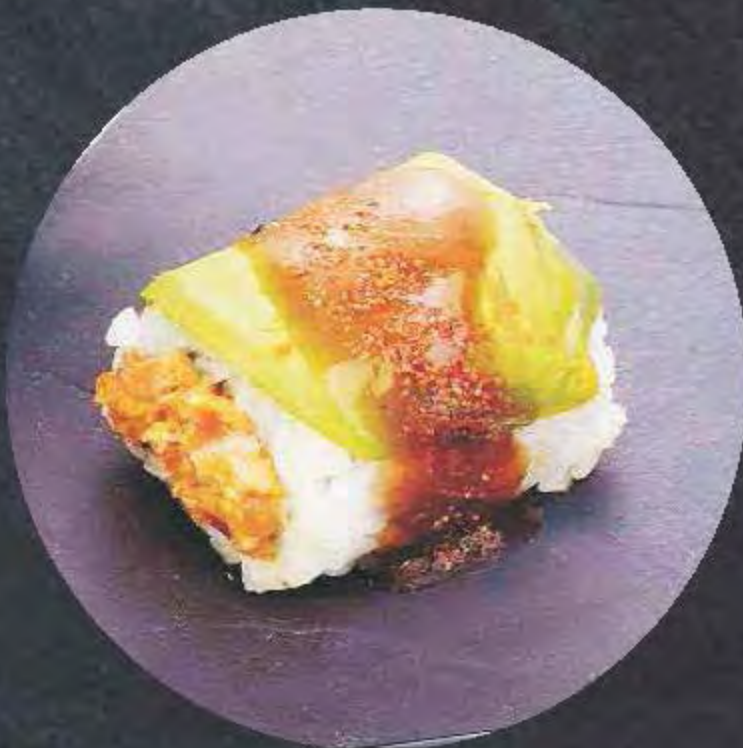
HIGH VOLTAGE ROLL - EEL Avocado - Eel 15,900