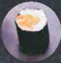
SHAKE MAKI Salmon 10,800