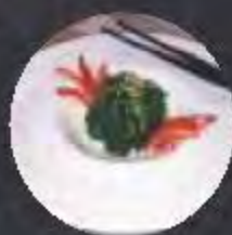
TERIYAKI STICKS 13,500