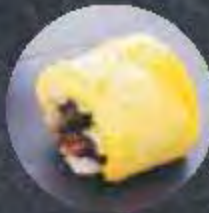
MANGO SPECIAL ROLL TUNA Spicy Tuna - Mango Sauce - Tempura Crispy 17,700