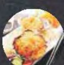
DYNAMITE SALAD Mixed Seafood- Lnuiki Mush room- Dynamite Sauce 31,000