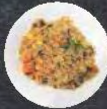
VEGGIE FRIED RICE Sweet Corn - Button Mushrooms - Carrots - Zucchini 9,200