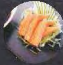
KANI Crabsticks 12,900