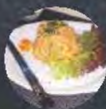
IZANAGI CRAB SALAD Sure Doed Crab - Special Savce Cucumber - Tobiko 25,600