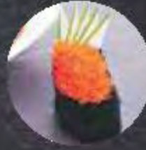
TOBIKO Flying Fish Eggs 8,900