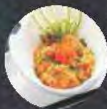
SALMON SALAD Salmon- Ginger- Spring Onion- Tagarashi- Sesame Seed- Cucumber 30,000