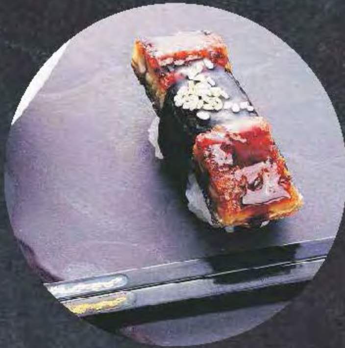
UNAGI Eel 17,700