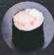
EBI MAKI Shrimp - Cucumber 10,000