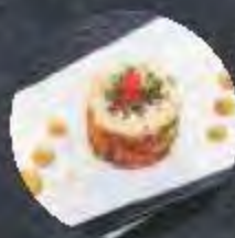
SALMON STARTER Diced Salmon - Avocado - Scallop - Tabiko - Wasabi Sauce - Marinated with Ponzu Sauce 30,200