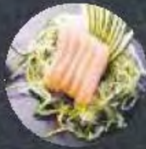
HAMACHI Yellow Tail 35,800