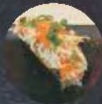
CRAB GUNKAN Crab Stick, Scallop, Ebi Sushi, Miso Mayo Sauce 10,500