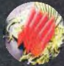
MAGURO Tuna 19,100