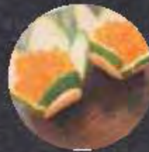
IKURA SASHIMI SALMON 12,300