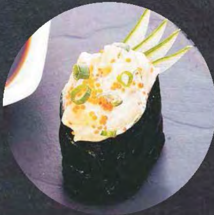
HATATE GAI Scallop - Mayo - Tobiko - Spring Onions Ragu - Chili Powder 12,900